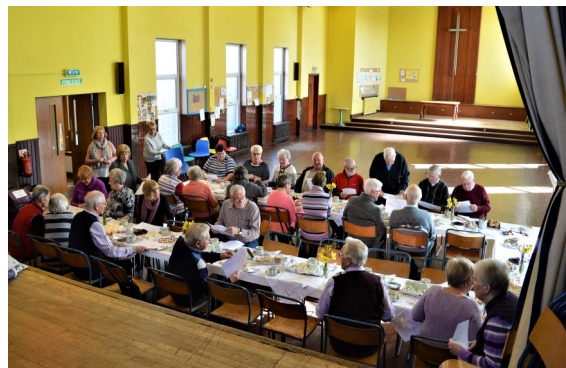
Waiting For Tea!!