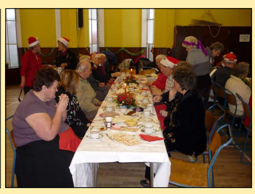
Bowling Club Christmas Party