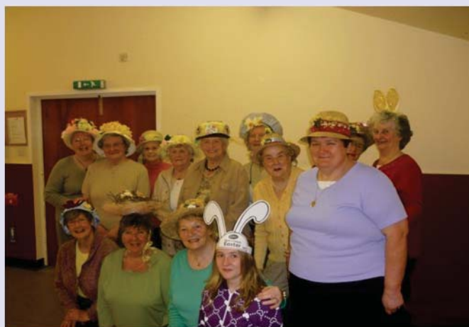
An Easter Bonnet competition in 2009

These dedicated members of our Church are often overlooked, not only giving of their time, but raising in the region of £1,500 each year for Church funds. Extra help is needed on Sunday mornings and although there is an average attendance on Tuesday mornings of around 25, that seems a small number compared with the size of our congregation. Please think about coming along now and again, you will find a warm welcome. The venue is in the North Hall every Tuesday from 10.00am