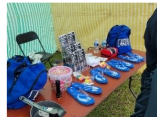
What is carried with us

In December 2015 Ayr and Prestwick Street Pastors started operating and continued to put out Patrols every Saturday night from 10pm till 3am until COVID struck until 7 th March 2020 and for just over a year nothing happened. We continued to remain in contact through Zoom. Then in July 2021 as things began to open, we started patrolling again. It also meant we had to refresh our First Aid Certificates and other courses. One of them is in the use of Naloxone which we now carry, and which reverses an opioid overdose via a nasal spray. To begin with everyone was apprehensive but pleased to be out and about again. It helped that we patrol outside and were supplied with Street Pastor face masks. Although we had to keep a safe distance it did not prevent us having some really good conversations with those out and about.