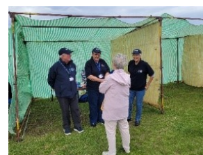
Street Pastors at Prestwick Promfest

Since COVID there has definitely been a change in the dynamics in Ayr and Prestwick. Ayr is generally quieter. However Prestwick is much busier. People are coming there from all over Ayrshire particularly Kilmarnock, Irvine and Kilwinning to have a good night out. It is interesting why people are coming out, last week we met a hen party out celebrating along with a group of ladies celebrating one having just got divorced. We have assisted a number of ladies who having had a good night had been “befriended” by a man. We thank the man then ensure the lady gets home safely and not taken advantage of.