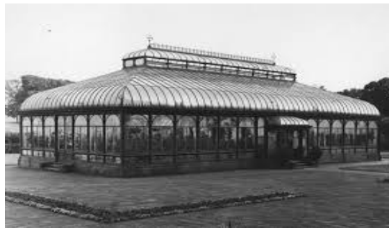
Original Conservatory built in 1879