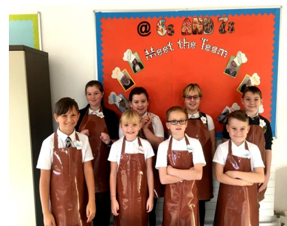
Above we see the satisfied customers and the excellent "Staff"